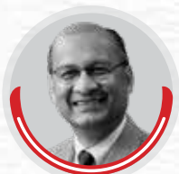
Vishnu Prakash IFS Former Ambassador, India's High Commissioner to Canada